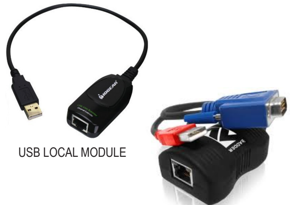
USB LOCAL MODULE